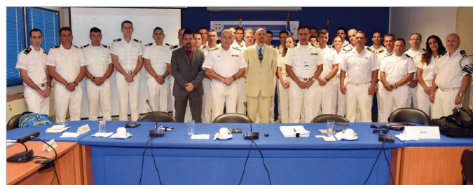
The course also included practical exercises on enforcement

In cooperation with the Hellenic Coast Guard, EMSA held a training course in Piraeus on 10-11 September on implementation and compliance in relation to the International Convention for the control and management of ballast and sediment from ships. The course was delivered by EMSA representatives and was attended by officers from central port authorities and directorates of the Hellenic Coast Guard. The topics covered included: detailed information on the BWM Convention; an update on ballast water treatment technology; the PSC view of control, monitoring and enforcement; and, sampling and type approval of BWM systems.