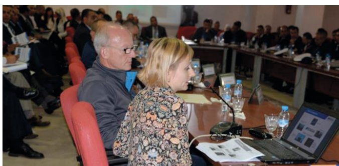
EMSA delivering a presentation at "SIMULEX" briefing, 25 April 2016

Briefing and "Open Ship": A briefing of the exercise took place in the morning of the first day (25 April 2016). The participants were presented with the scenario of the exercise and the role of each institution involved. EMSA explained oil spill response tools that are made available to the SAFEMED III countries, with a specific emphasis on IMDatE (CleanSeaNet and AIS data exchange) as well as on Stand-by Oil Spill Response Vessels network, notably vessels available in the Mediterranean, their oil spill response capacities and the procedure to request the vessels.