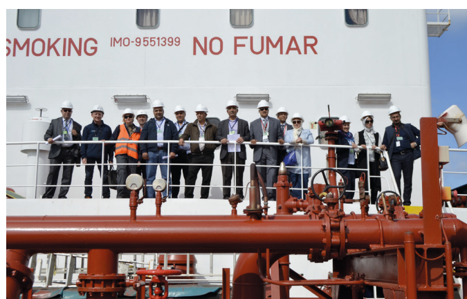
Guided visit of Monte Anaga, 25 April 2016

The briefing was followed by an "Open Ship" event where Moroccan authorities and representatives of the SAFEMED III beneficiary countries paid a visit to the Monte Anaga vessel. It was a good occasion to provide information regarding the vessel and the equipment's technical details to the 83 visitors.